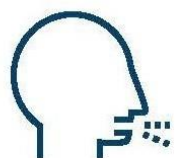
Cough (or worsening cough)