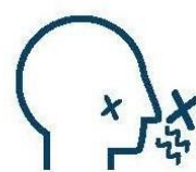
Loss of sense of smell and taste